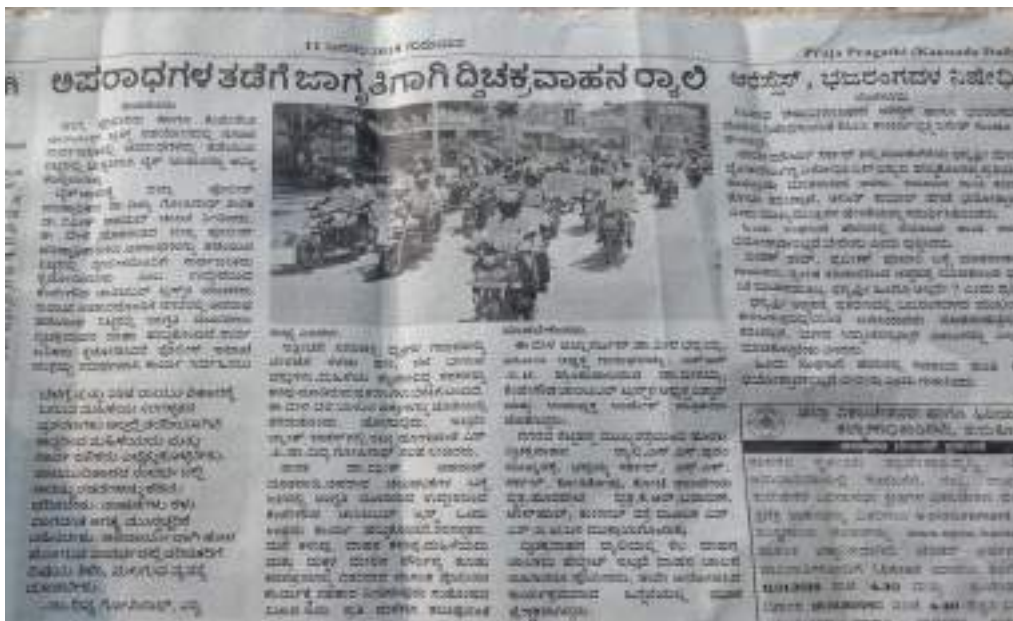
Local News paper item "Prajapragathi" on 11-1-2018