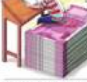
More than 2000 colleges across Karnataka are not registered with the Higher Education Department.

What do you say about the fee hike? The fee hike is a good thing. It will help the government to improve the quality of education. It will also help the government to reduce the burden on the state. It will also help the government to improve the infrastructure of the colleges. It will also help the government to improve the faculty of the colleges.