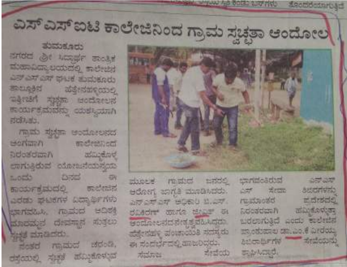
Tumkur local Newspaper "Prajapragathi" on 15-10-2016