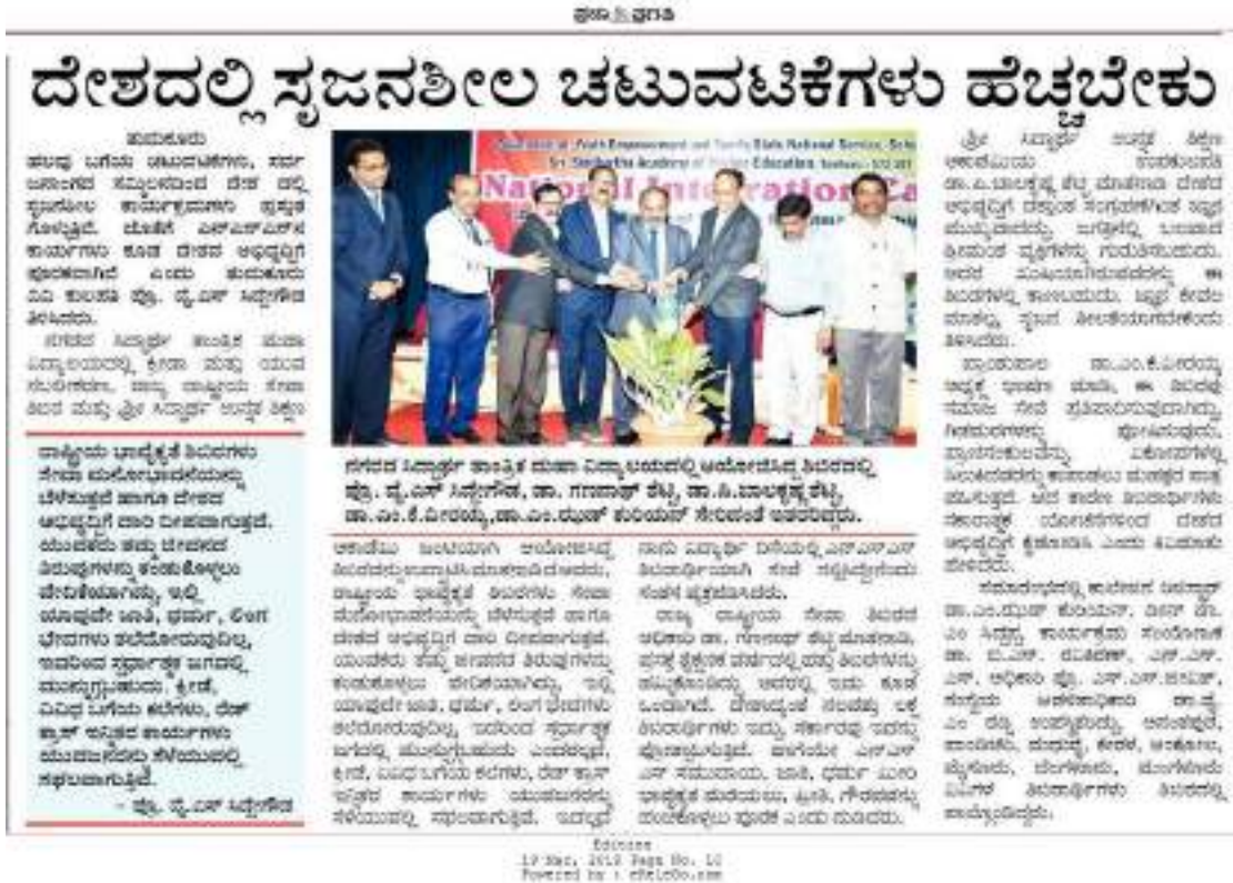
Praja Pragathi news paper item 19-3-2019