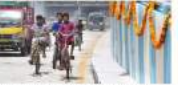
BJP and Congress leaders gathered for the inauguration of the underpass.