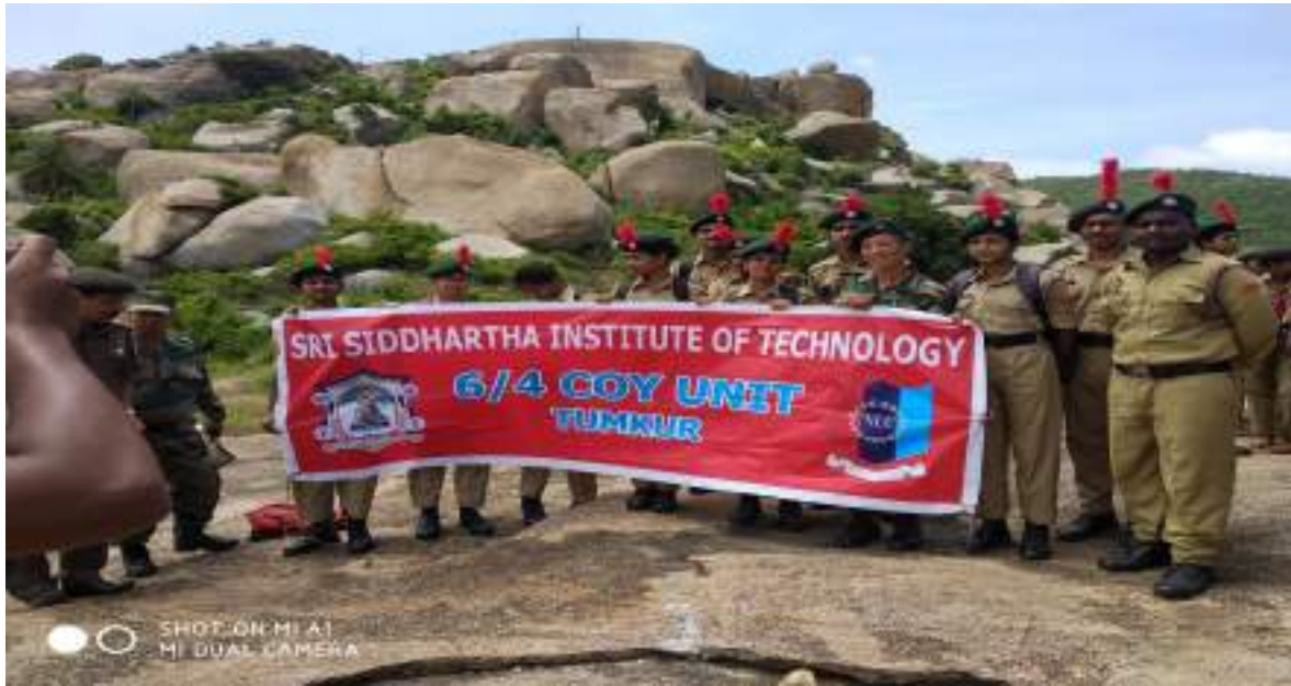
The various program are conducted in the camp on 19/06/18 trekking and swachh bharat abhiyan is held on belagumaba