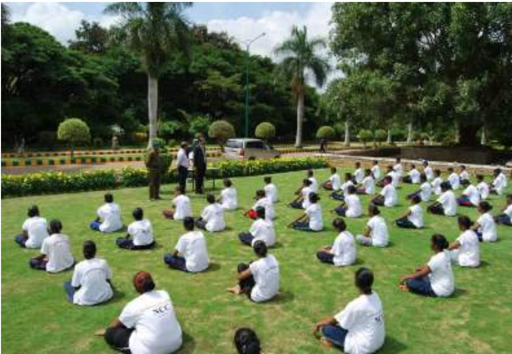
Sri Siddhartha Dental College, Tumkur