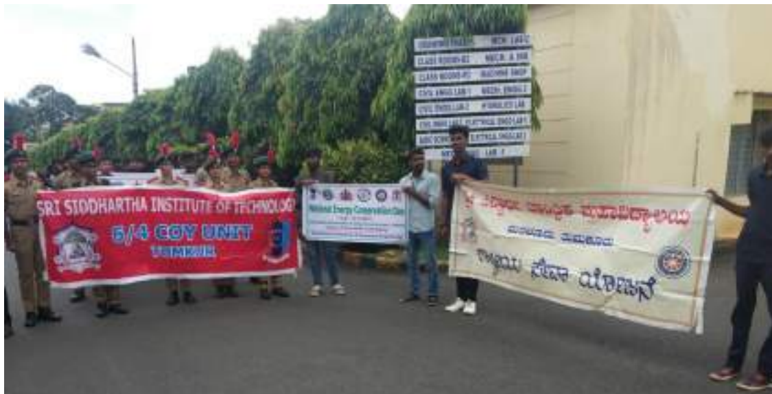
Students participating in the rally