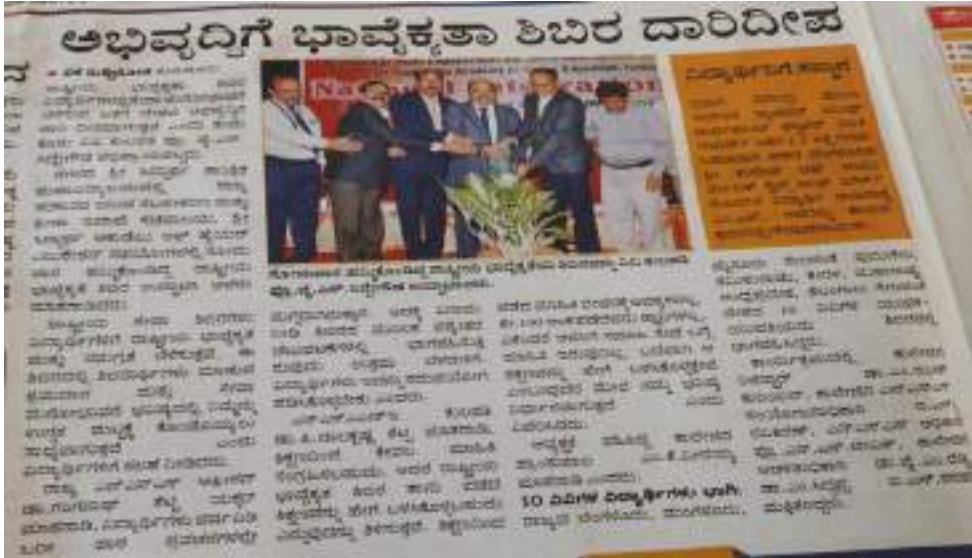
Vijaya Karnataka news paper item 19-3-2019