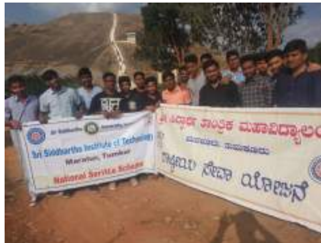
Fit India Movement –trekking to Basadi hill