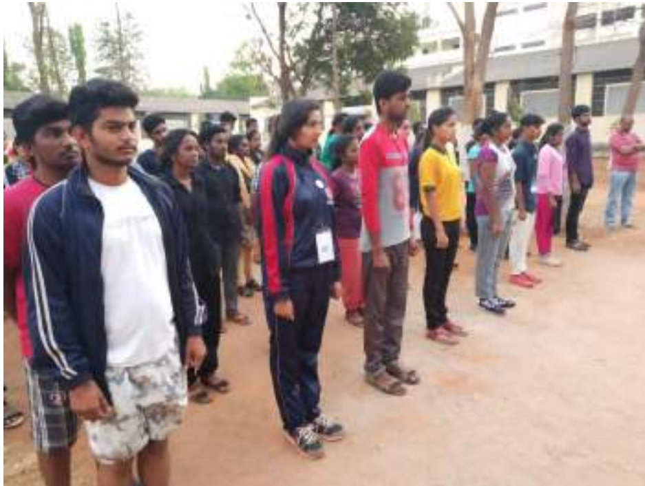
Assembly for flag hoisting