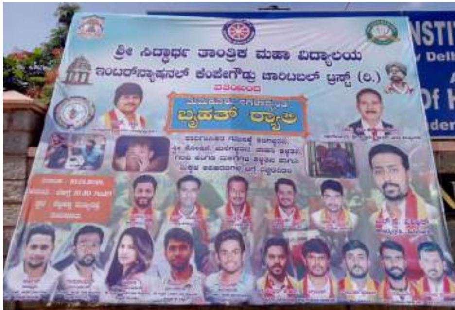
Flex Banner displayed at the Entrance of SSIT,Tumkur