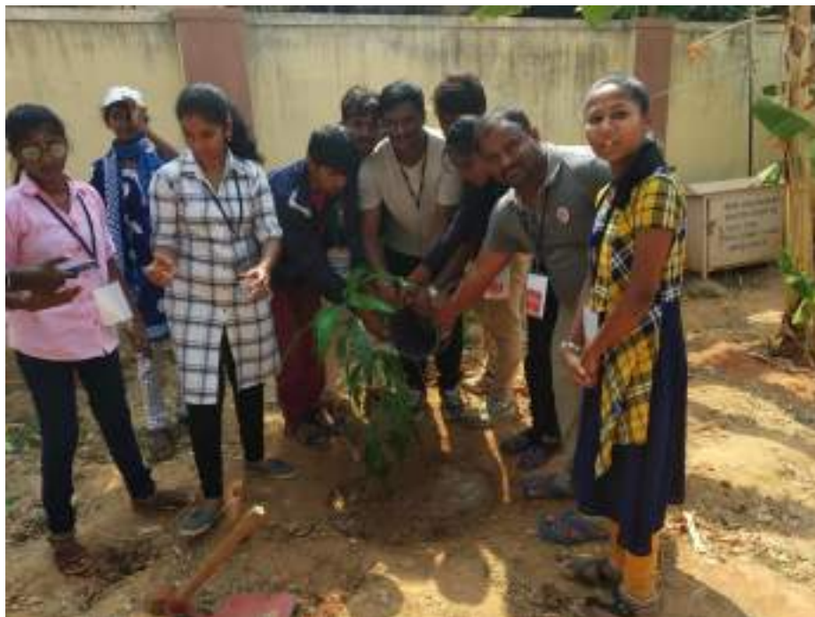
Tree saplings plantation